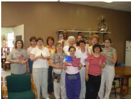
All American Planning Meeting