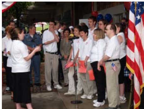
All American Singers