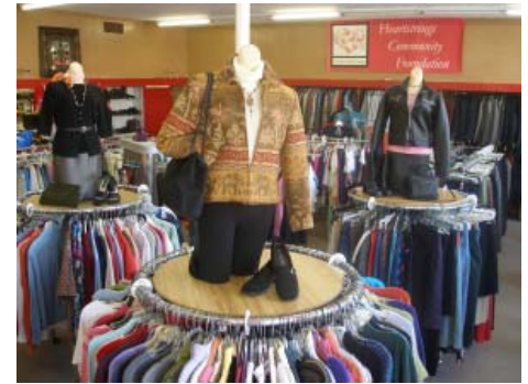
Sacks on Santa Fe